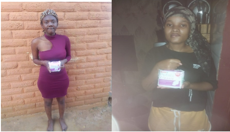
Youth beneficiaries receiving sanitary pads

Tateni received a donation of sanitary towels from Country Road store. The donation was shared between Youth Development and Home and Community Based Care Departments. During this reporting period 18 young ladies benefited.