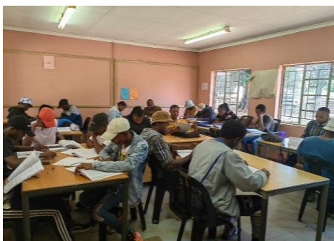
Training in progress

On the 27 th and 28 th of February 2023, we were joined by a representative from National Youth Development Agency (NYDA) that assisted Tateni Youth Development Department to conduct mock interviews. His involvement had a positive impact as we were able to interview all the participants. Mistakes identified were addressed and recommendations were made in preparation for official future job interviews. Upon completion of the training, a certificate ceremony was held at Mams Grill on the 03 rd of March 2023.