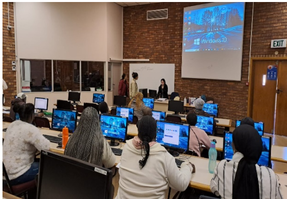
Basic Computer training at Pretoria University, Mamelodi campus.

Fordham University Centre is a Community Engaged Learning which build bridges between University campuses and neighbouring communities in order to promote a more just and equitable world. Fordham University students hosted a two days basic computer training at University of Pretoria, Mamelodi campus on the 25 th and 26 th of May 2023. The Department immediately shared the information via WhatsApp group and 5 of Tateni youth beneficiaries attended the training. The course was short but was an eye opener. They all received Certificate of Attendance.