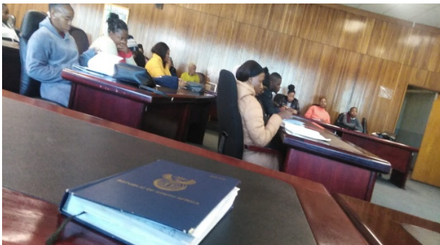
Jumpstart training in progress