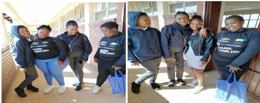
Velle representatives registering learners at school.

Ten of Tateni Youth Development beneficiaries we given an opportunity to be Velle school representatives. They are assisting school learners with digital platforms and intervention to support e-learning. Five are working at different local schools and their target is to recruit and register 10 learners per day. They earn between R1500.00 to R1900.00 per month depending on how many learners they managed to register during that month. The other 5 are waiting for employment contracts.