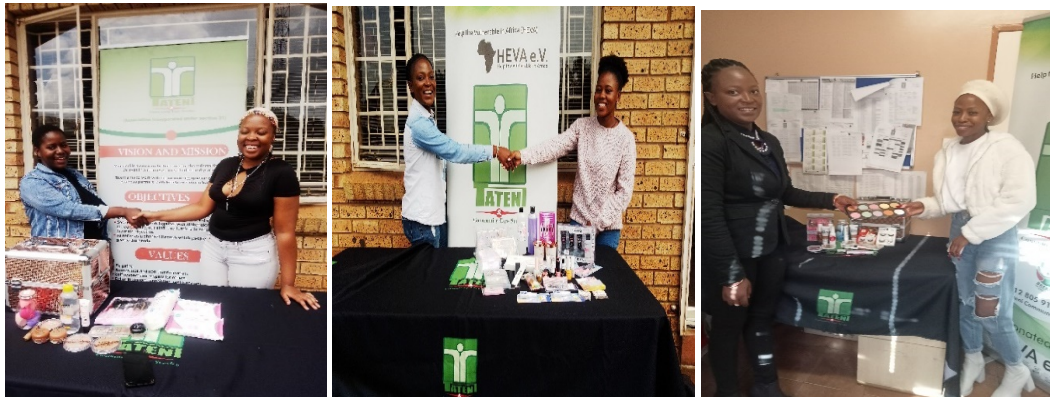
Deserving youth received start-up kits.

As the family circumstances of the three youths were assessed and they were found not to be financially coping, the Department purchased Business start-up kit to enable them to be financial independent.