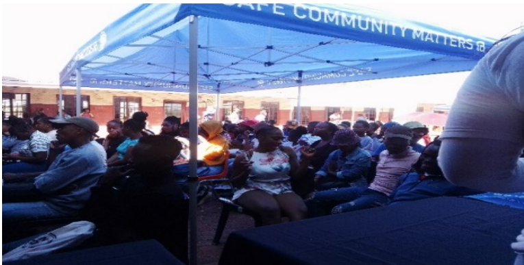
Career fair at Reneilwe CLC

Tateni Community Care Services was part of the yearly career fair hosted by National Youth Development Outreach (NYDO) at Reneilwe Community Learning Centre. The career fair took place on the 26 th of April 2023 and the Youth Development Department marketed our services.